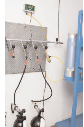
CO Clear TM in use

By installing an Analox CO Clear TM you can assure your customers that their tank fills are free from Carbon Monoxide. Your customers will have faith in their mix knowing it has been continuously monitored. Go above and beyond - fit an Analox CO Clear TM