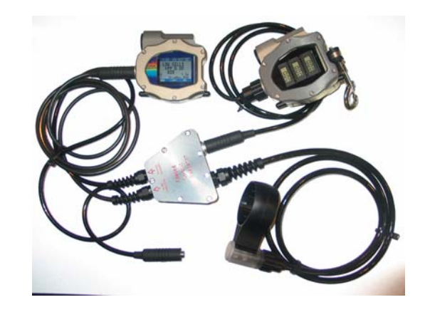
Single PO2/3 x HP sensor version